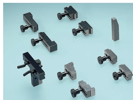
ESU accessories setting jaws/ measuring anvil