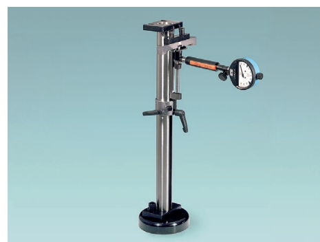
ESU Setting Device with vertical measuring axis