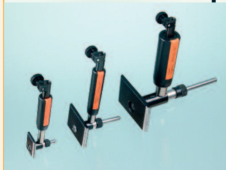
Precision bore gauge SCA