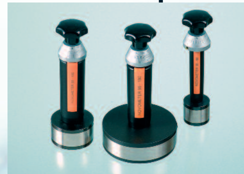
Contour Gauge Novometer