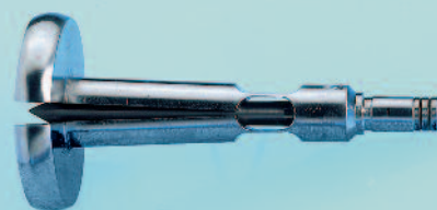
Standard OSIMESS probe OS